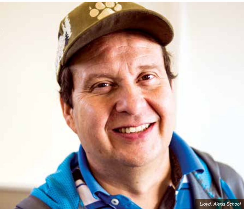
Lloyd, Alexis School