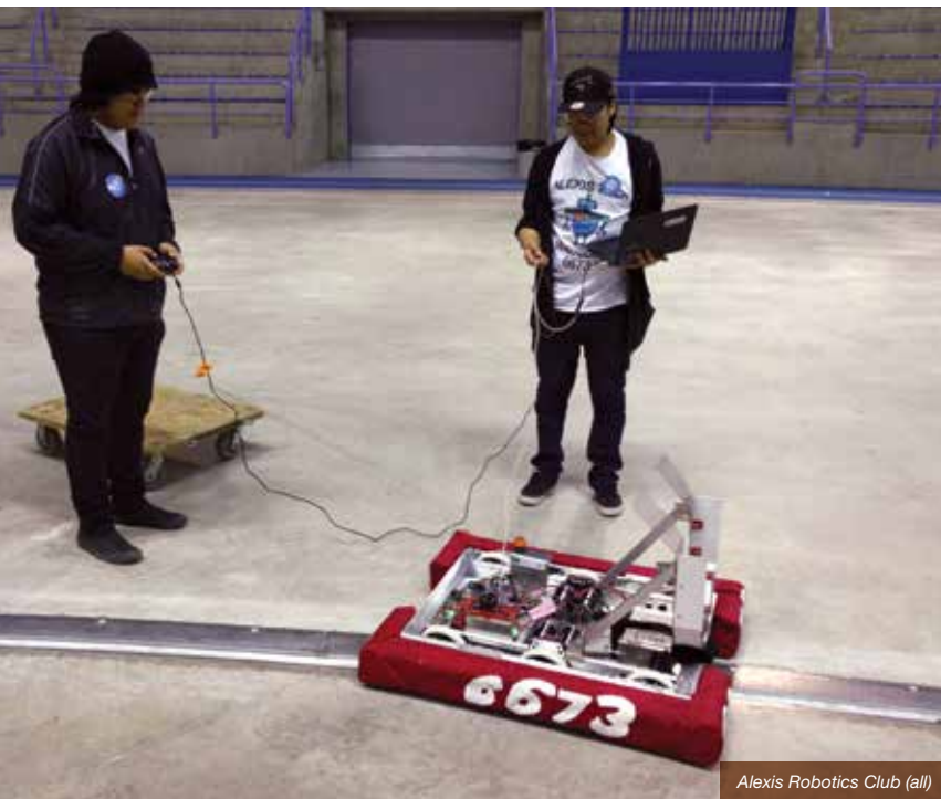
Alexis Robotics Club (all)